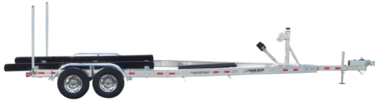
Image of Model #5S-AC28T10000102TB2. Options and features may differ.